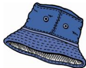
Bucket style hat